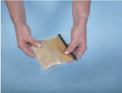
Take the twinpack out of the outer wrapper