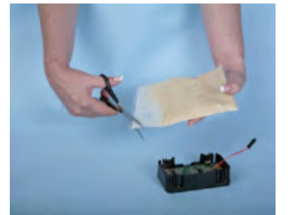
The pack is now ready for use