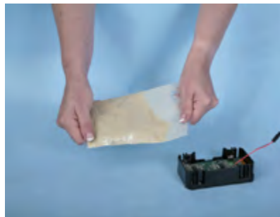
Using the clip or rail push the material away from the pointed end