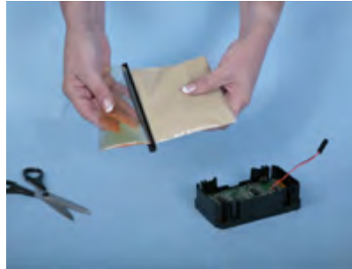
Open out the twinpack