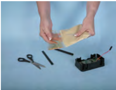
The resin and hardener are now ready to mix