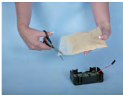
Take a pair of sissors and snip the pointed end of the pack