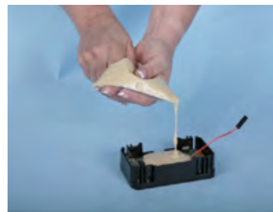
Carefully pour the material into/onto the component