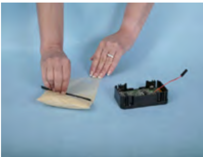
Mix the material again thoroughly until a uniform mix or colour is achieved