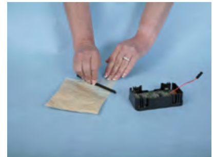
Using the clip or rail push the material away from the corners