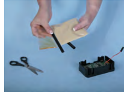
Remove the dividing clip and rail